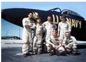
1953 Blue Angel Team